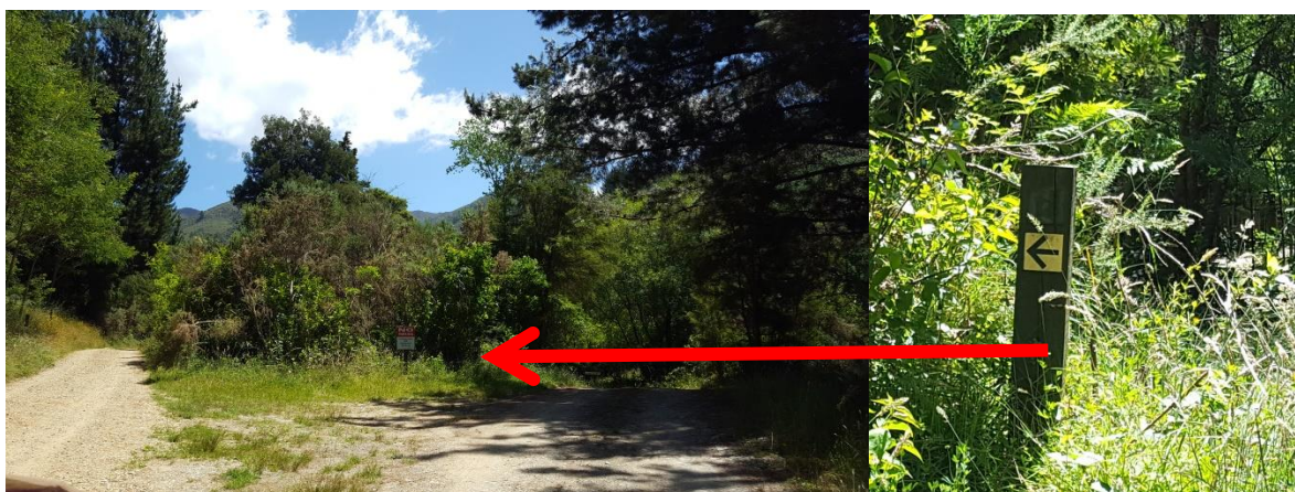
Fork in the road, with hidden left arrow, January 2017