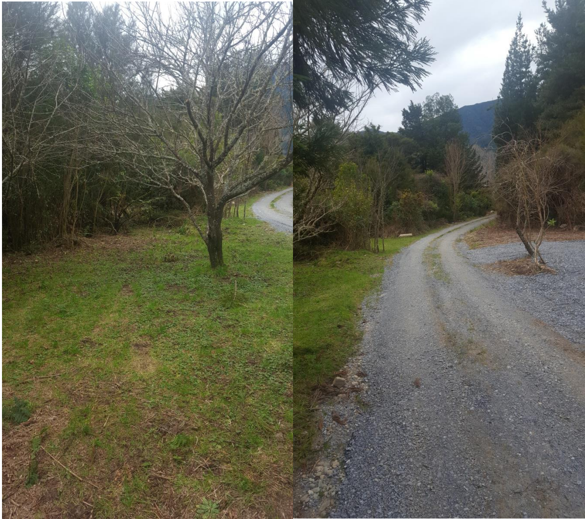
Looking down the road, Intentions shelter parking for four on the left of road, main parking for ten on the right. July 2017