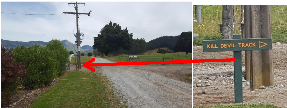
Kill Devil track turnoff, Uruwhenua Rd, January 2017

A lot of the signage had fallen away, become hidden by foliage, or was now overshadowed by bigger roadways. In conjunction with DOC who made us new, larger or replacement signs, the access to the Kill Devil track is now much clearer, and it is more obvious where to park.