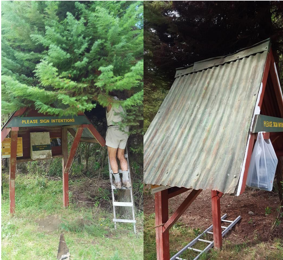
Max, trimming branches above the shelter. and scrubbed back ready for paint, February 2017