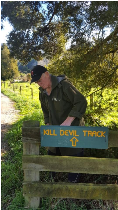
New sign placed half way up driveway, June 2017