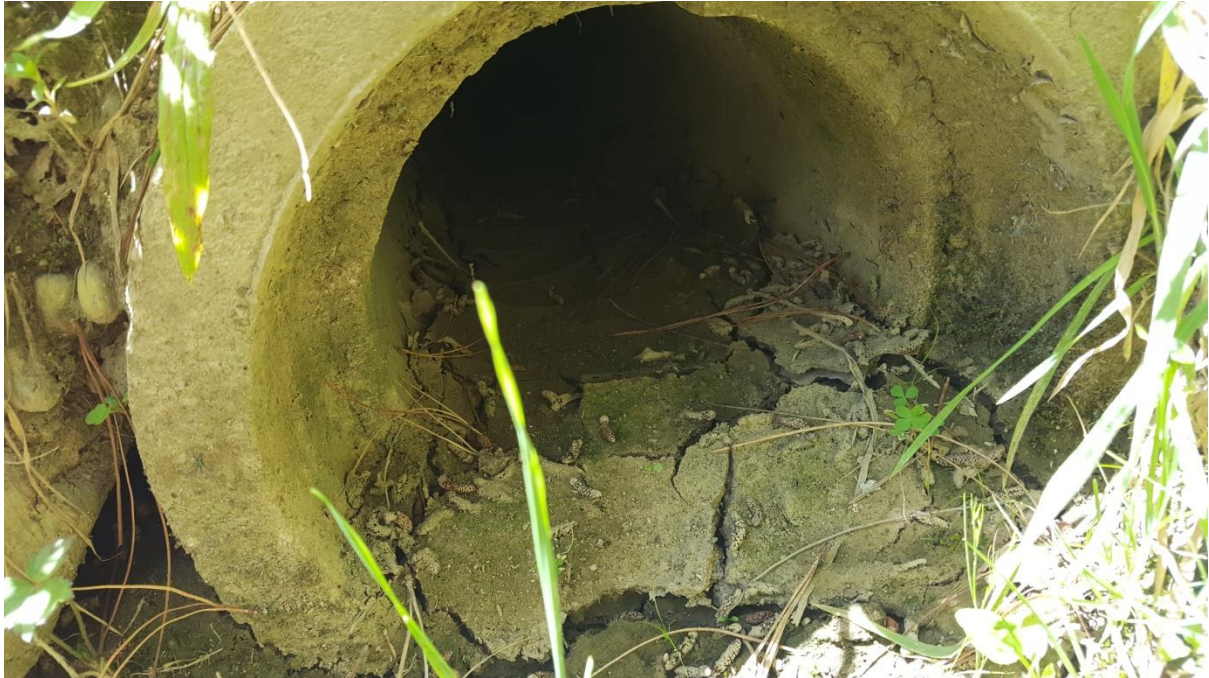
Pipes under roadway, currently blocked at inaccessible point, January 2017

A mole plow that hauled the telephone lines onto the neighbouring properties had shifted and broken the pipes for the culvert that ran under the road. Whilst we had the digger for clearing a parking pad, we dug up the pipes and managed to make four pipes line back up to remedy the poor drainage of the road in.