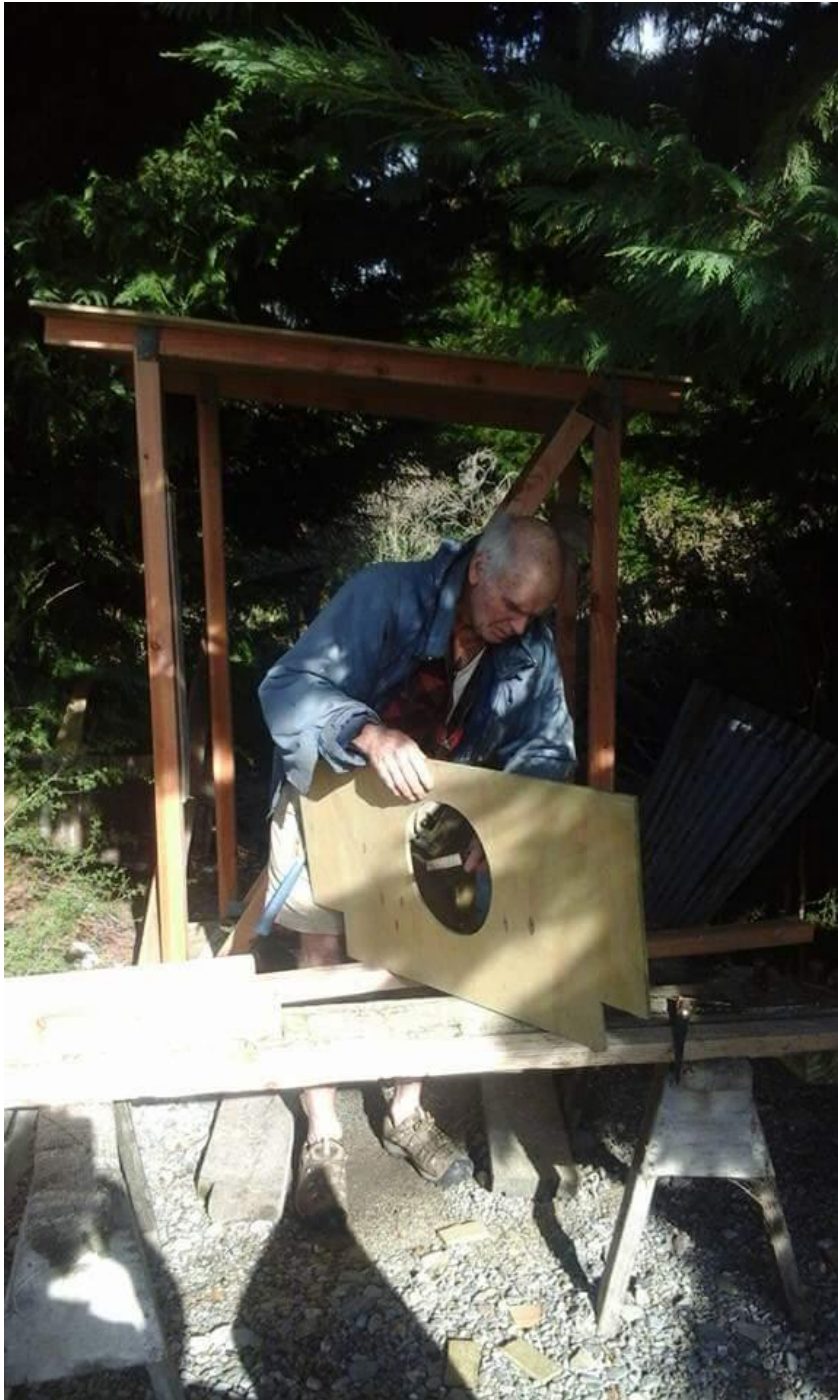
New toilet in progress. April 2017.