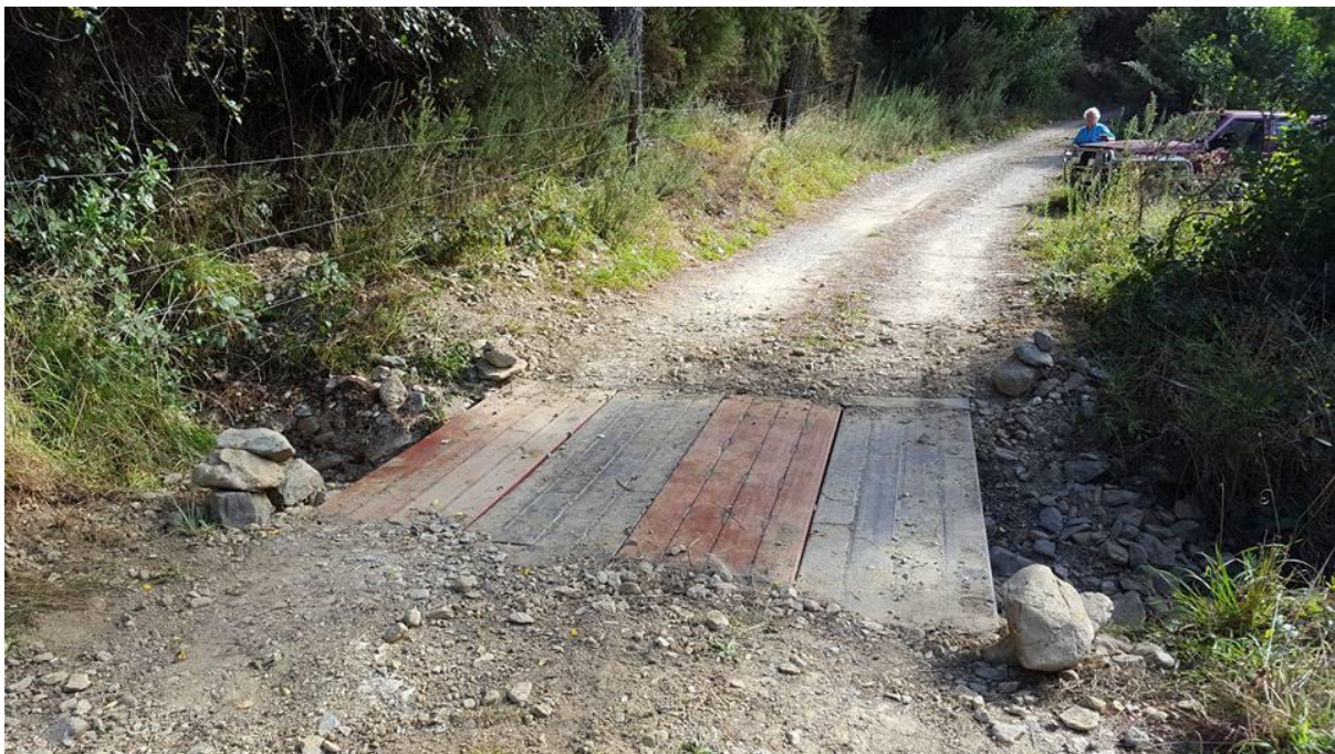
Two ramps become four, safety increased dramatically and scare factor decreased. April 2017