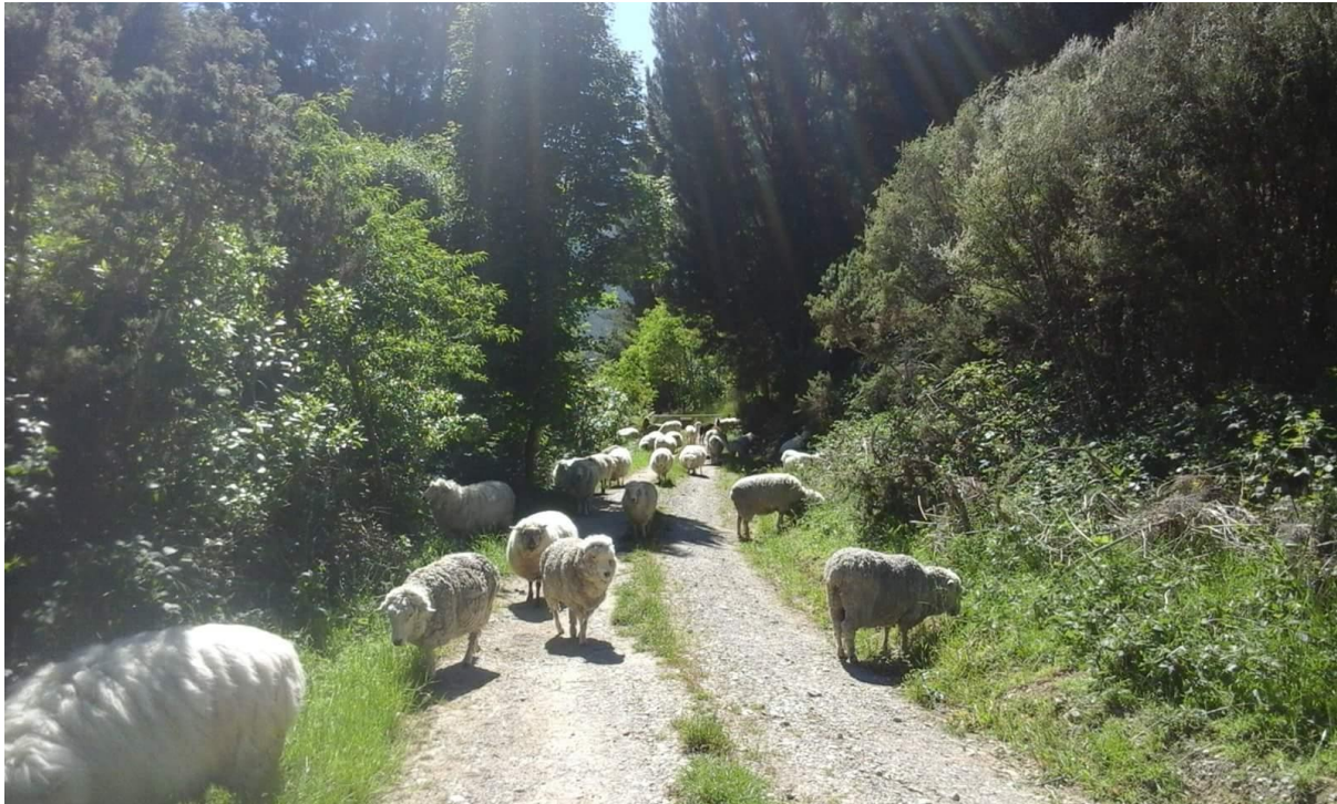
Sheep on scrub clearing duty, March 2017

The narrow, wheel width ramps over the forde have now been doubled in width. This has made the forde safer and easier to cross for those unfamiliar with the roading.