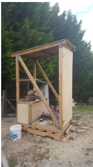
New Long drop being created April 2017

Prior to starting their walk/tramp/ride recreationalists were toileting on the side of the driveway. This made for toilet paper flying around the carpark, and strategic dodging of the odd 'landmine'. We have built a long drop and positioned it discretely in trees, away from the stream bed. We will take the responsibility for servicing and maintaining the long drop.