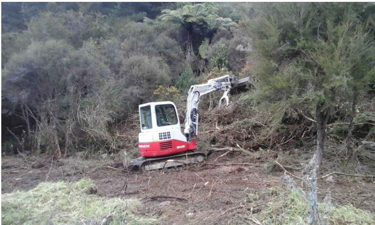
Scrub being cleared, main parking area. July 2017