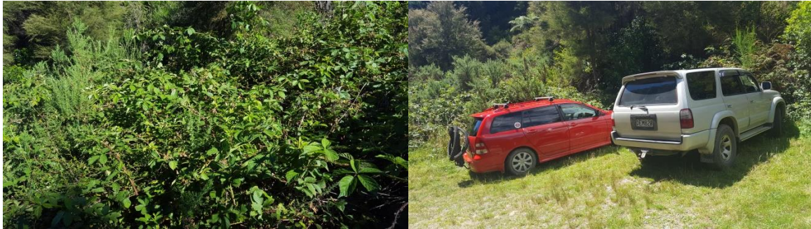
Scrub north of current parking, and parking for maximum of three, as at January 2017

There was minimal parking within the approved carpark area, as the land had been over-run with scrub, namely blackberry and gorse. After clearing the blackberries and gorse, there is now parking for more than eighteen cars. This is compared to the previous space to park for three vehicles. A digger was utilised to create a parking platform where the more vigorous blackberry and gorse was growing that was unable to be cleared by hand.