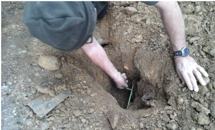
Blockage found! July 2017