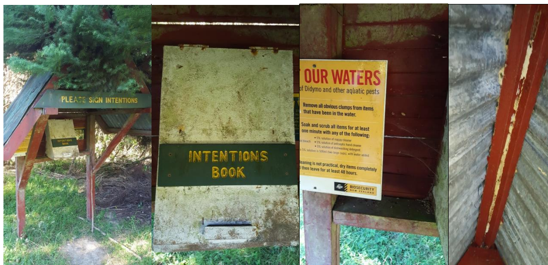
Intentions Shelter, January 2017.

The shelter was starting to look 'a little rough on it'. The trees were overhanging it, and the debris from the trees, was catching on the top of the roof, rotting and causing the paint to dissolve. Anne stripped back the shelter, removed the paper wasp nest and repainted using donated paint from Dulux's 'Protecting our Place' partnership. The shelter is now dressed in the new DOC colour scheme colours.