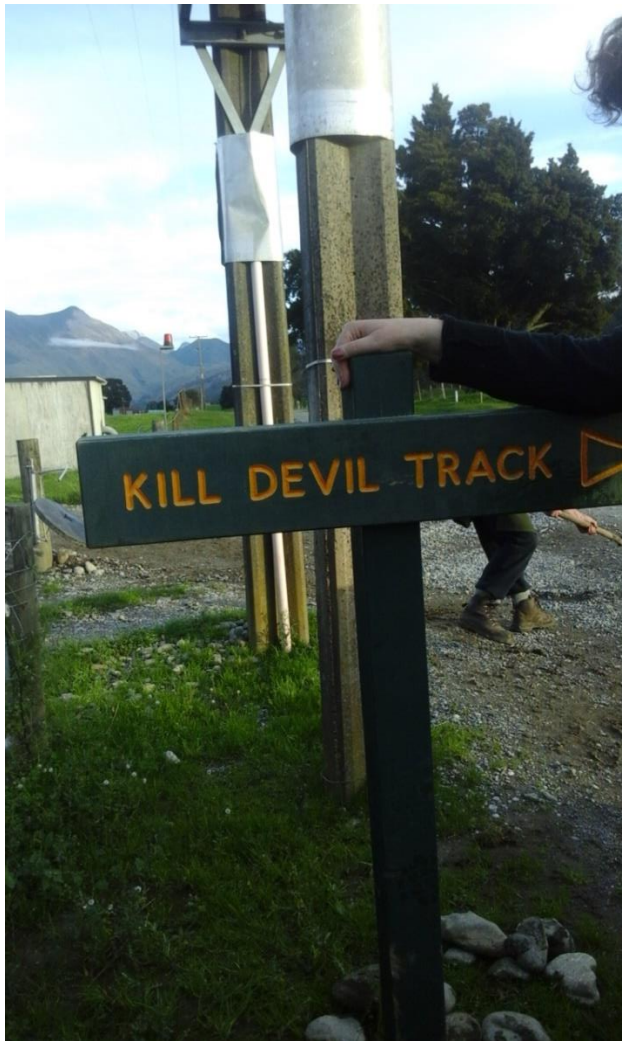
Old sign on newer higher post, June 2017.