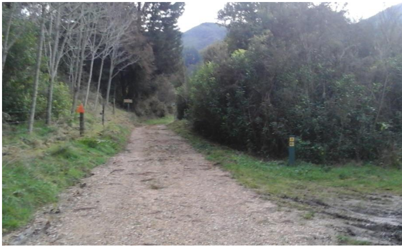
Fork in the road. Direction sign moved & repainted, 'tramper' logo added. February 2017