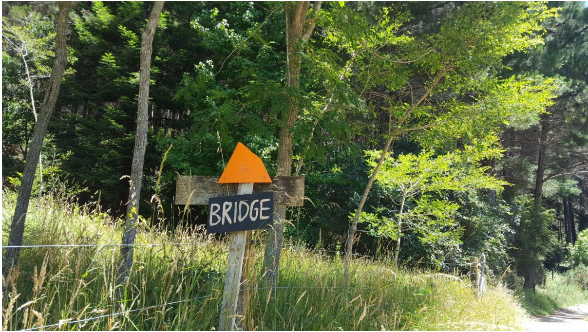
Warning sign prior to coming over brow of hill onto wheel track wide forde, January 2017