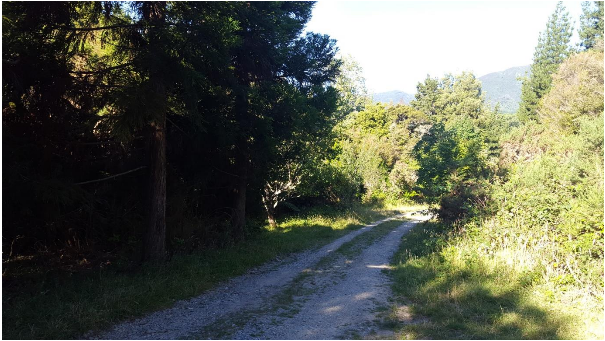
Looking down the road, no available parking. January 2017