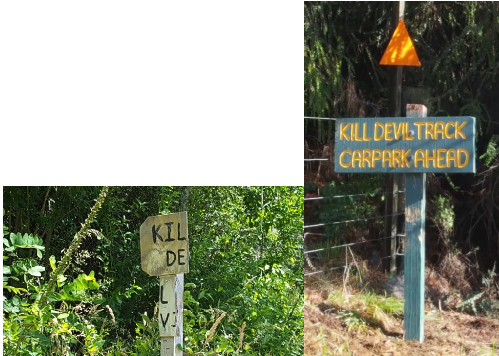
Kill Devil Track sign, January 2017 and its replacement, July 2017.