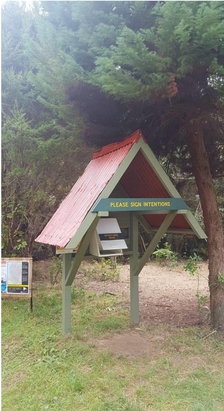
Intentions Shelter – Completed February 2017