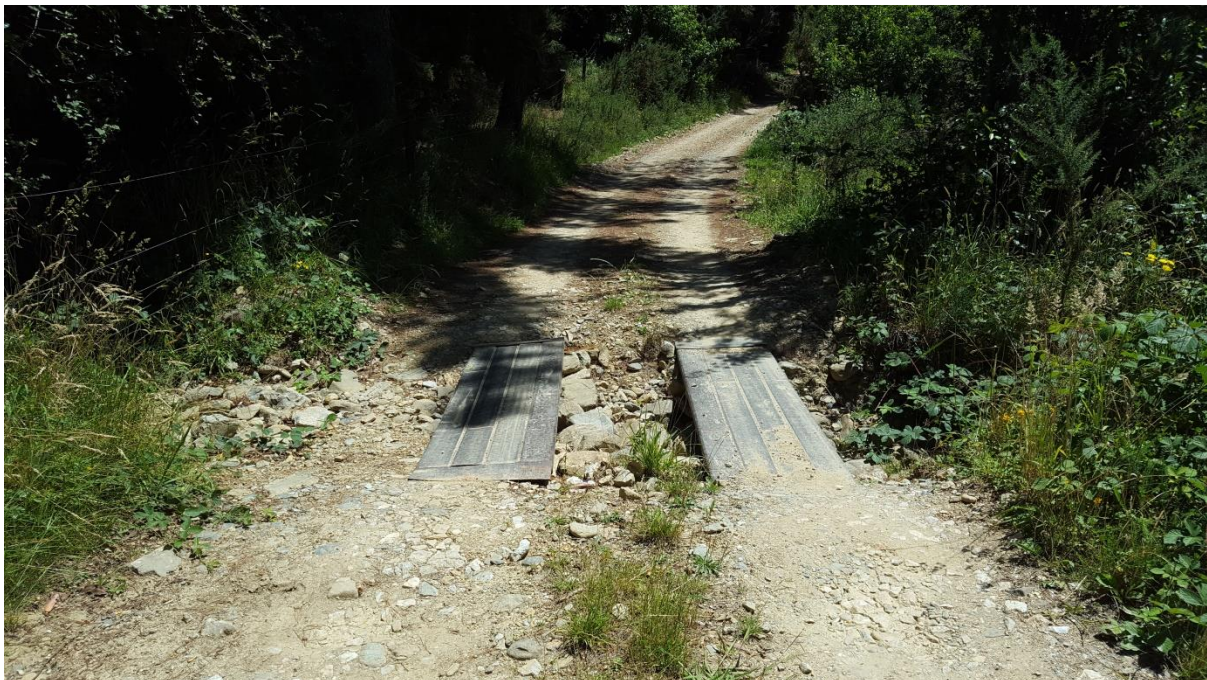
'Narrow crossing', January 2017

The narrow, wheel width ramps over the forde have now been doubled in width. This has made the forde safer and easier to cross for those unfamiliar with the roading.