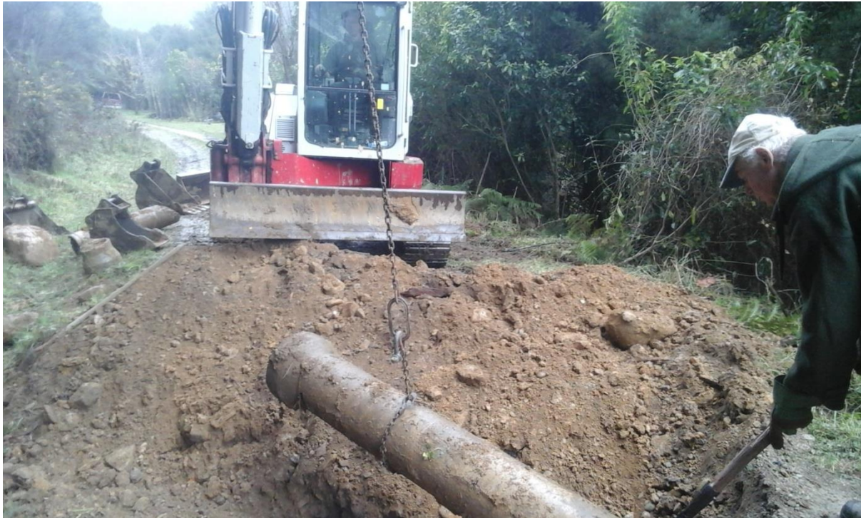
Pipe repair – Kill Devil style, July 2017