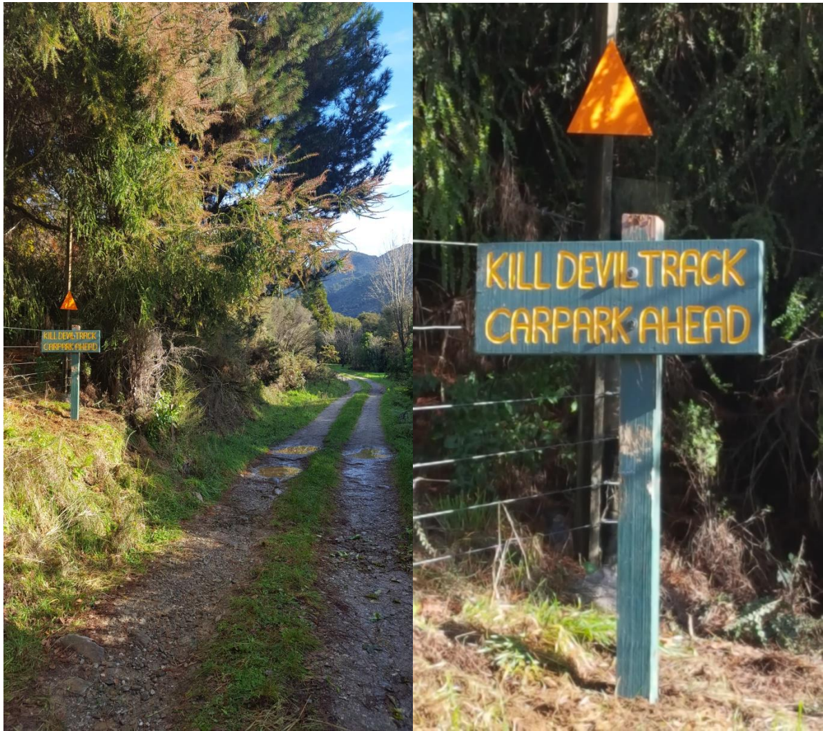
Next new sign leading the way, June 2017.