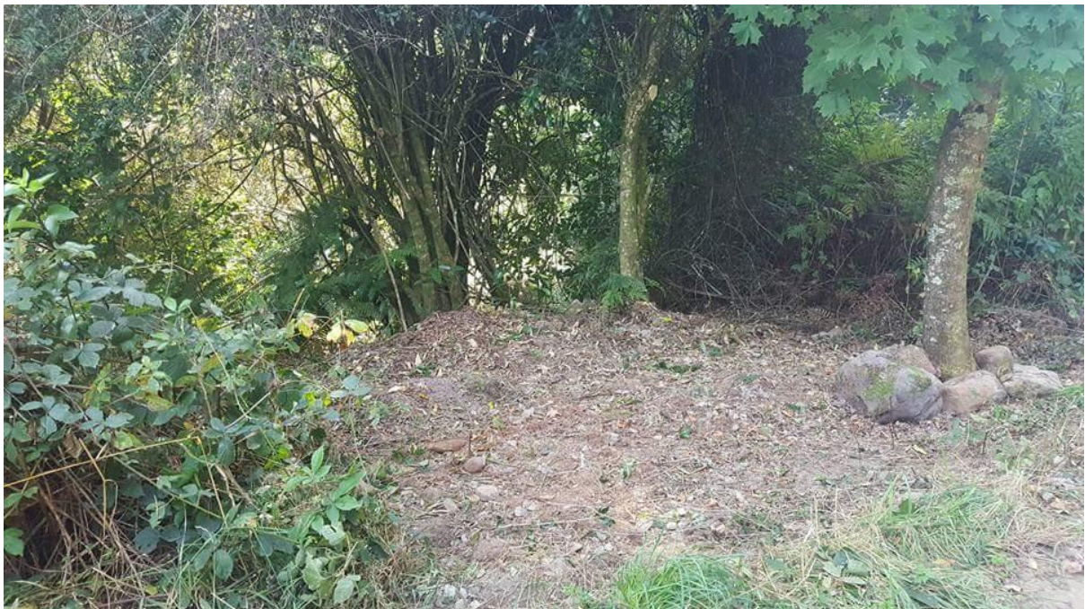
More overflow parking. Will suit one brave car! April 2017.