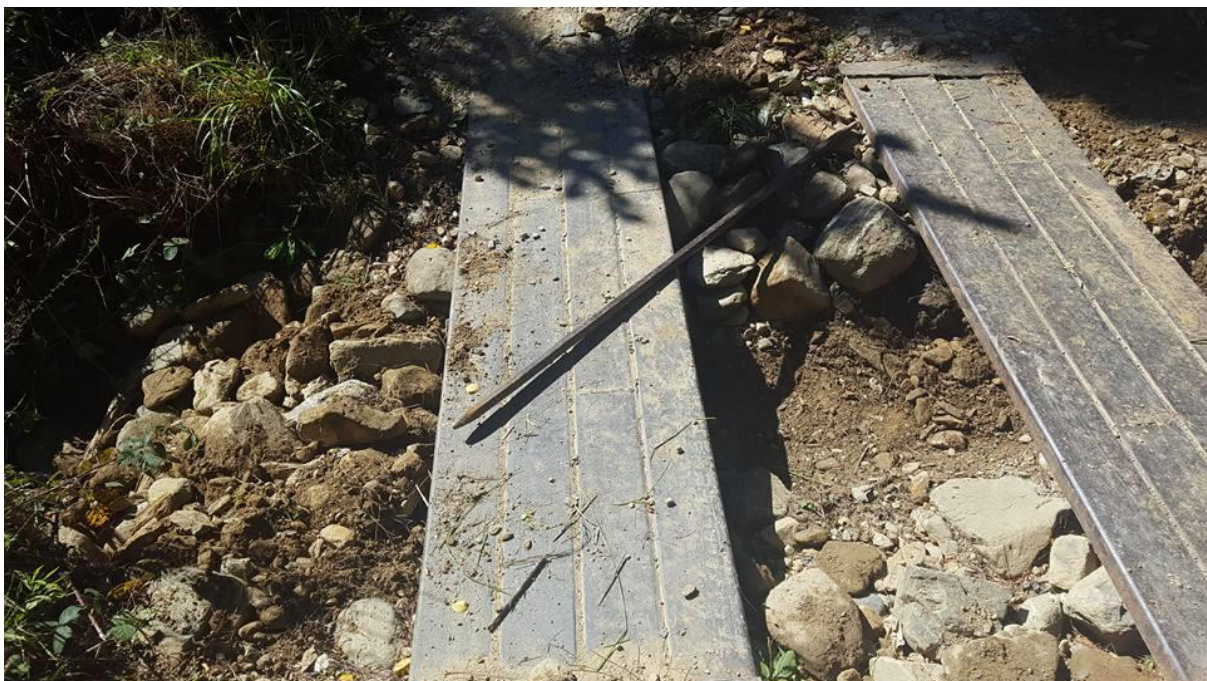
Re-digging ford in preparation for two additional ramps.