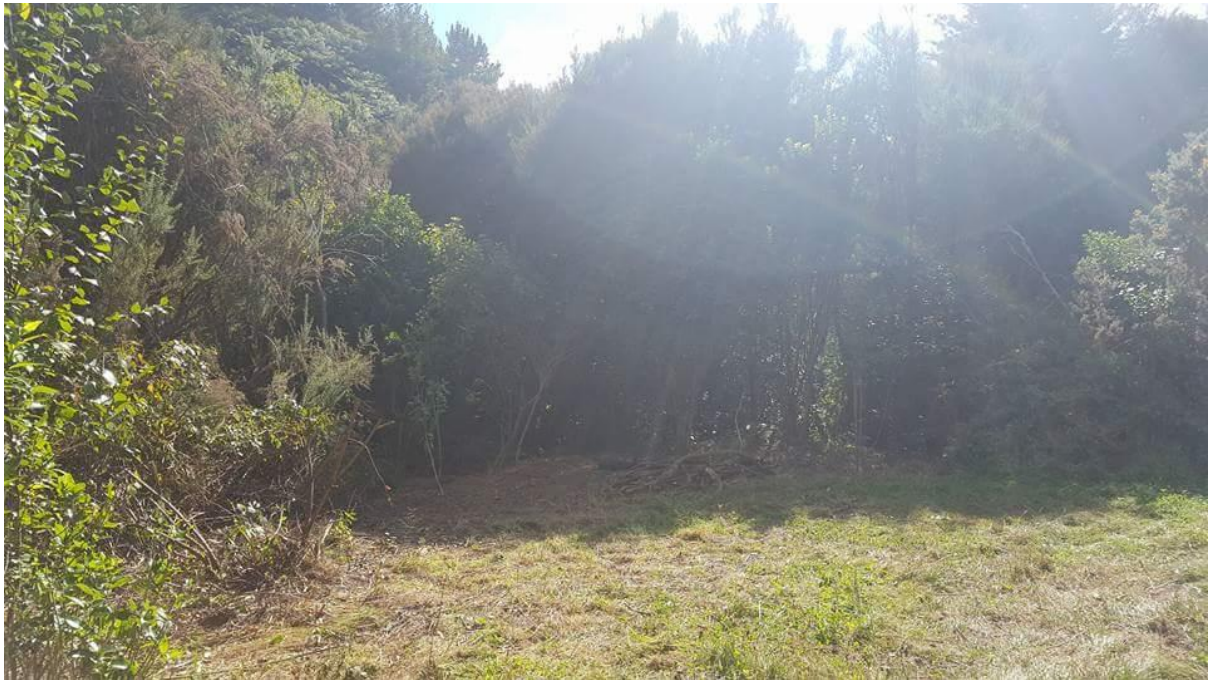
Same area, now overflow parking for three cars. June 2017.