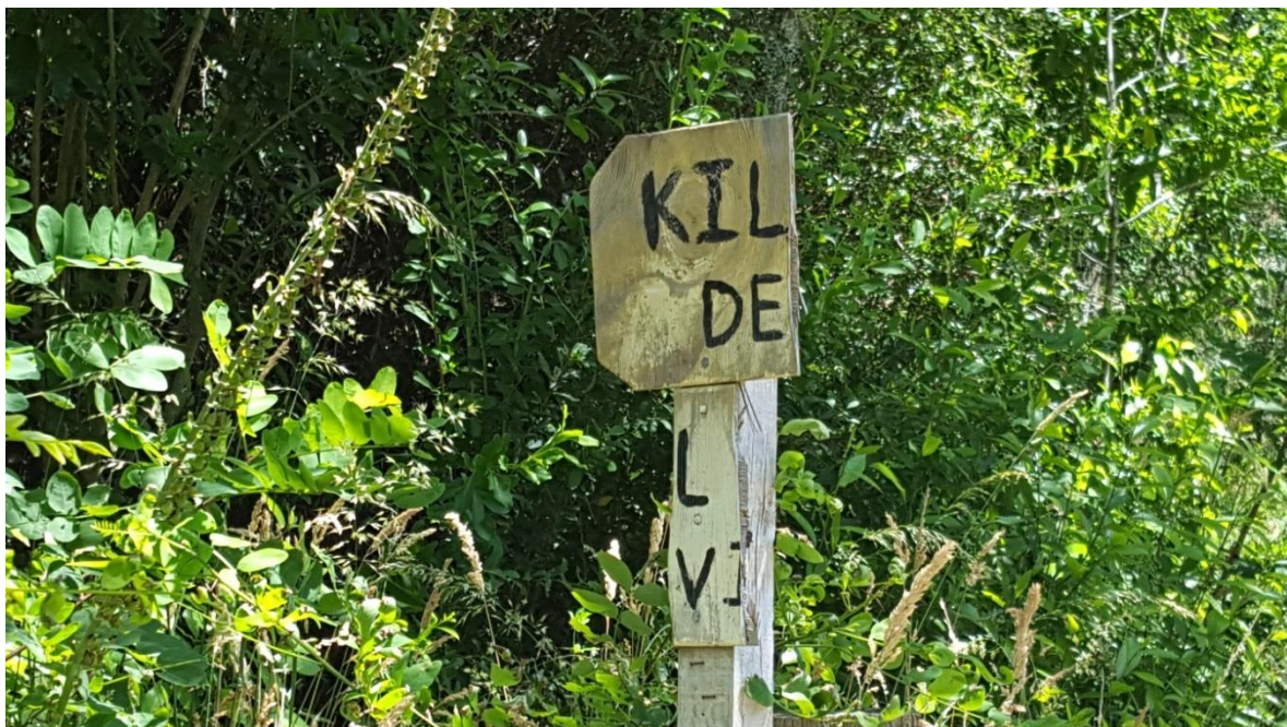
Welcome to the Kill Devil!!,(aka as Kil De L Vi) January 2017